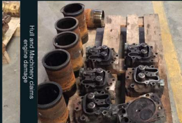
Hull and Machinery claims engine damage