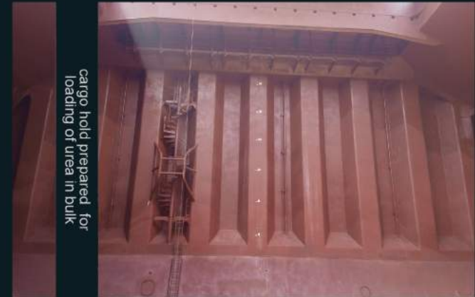
cargo hold prepared for loading of urea in bulk