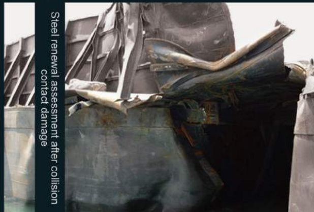
Steel renewal assessment after collision contact damage