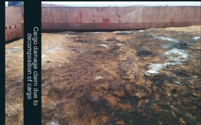
Cargo damage claim due to decomposition of cargo